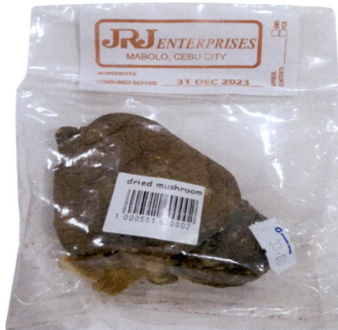
Figure 1. Unregistered JRJ ENTERPRISES Dried Mushroom

The Food and Drug Administration (FDA) warns all healthcare professionals and the general public NOT TO PURCHASE AND CONSUME the unregistered food product: