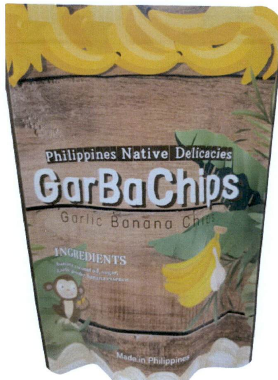
Figure 1. Unregistered PHILIPPINES NATIVE DELICACIES Garbachips Garlic Banana Chips

The Food and Drug Administration (FDA) warns all healthcare professionals and the general public NOT TO PURCHASE AND CONSUME the unregistered food product: