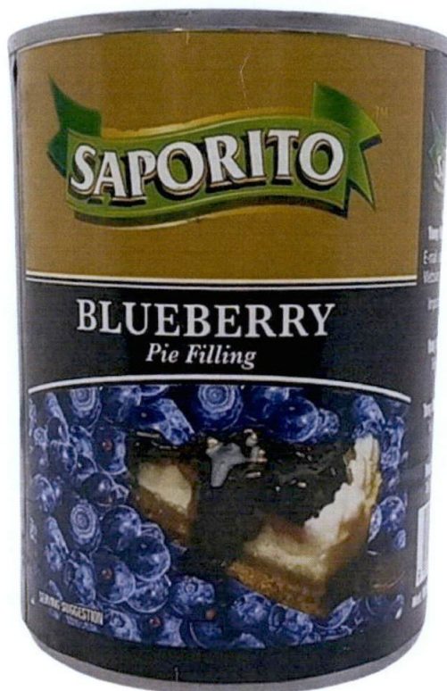
Figure 1. Unregistered SAPORITO Blueberry Pie Filling

The Food and Drug Administration (FDA) warns all healthcare professionals and the general public NOT TO PURCHASE AND CONSUME the unregistered food product: