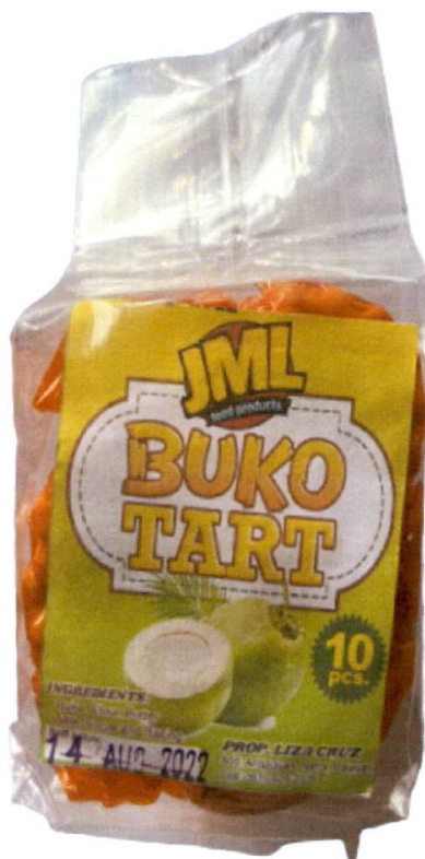
Figure 1. Unregistered JML FOOD PRODUCTS Buko Tart

The Food and Drug Administration (FDA) warns all healthcare professionals and the general public NOT TO PURCHASE AND CONSUME the unregistered food product: