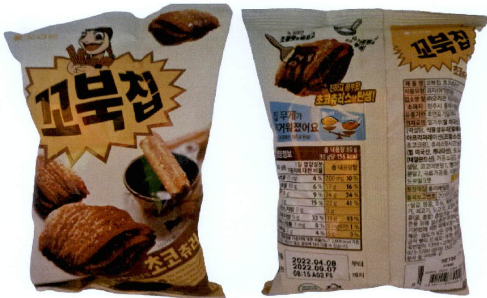
Figure 1. Unregistered Choco Churros in White and Yellow Packaging with Image of Brown Churros (In Foreign Language)

The Food and Drug Administration (FDA) warns all healthcare professionals and the general public NOT TO PURCHASE AND CONSUME the unregistered food product: