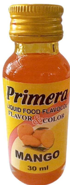
Figure 1. Unregistered PRIMERA Liquid Food Flavocol Flavor & Color Mango

The Food and Drug Administration (FDA) warns all healthcare professionals and the general public NOT TO PURCHASE AND CONSUME the unregistered food product: