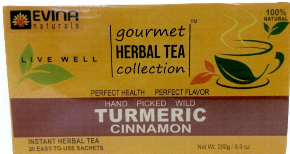
Figure 1. Unregistered EVINA NATURALS Live Well Gourmet Herbal Tea Collection Turmeric Cinnamon

The Food and Drug Administration (FDA) warns all healthcare professionals and the general public NOT TO PURCHASE AND CONSUME the unregistered food product: