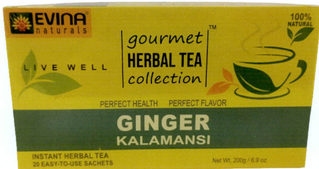
Figure 1. Unregistered EVINA NATURALS Live Well Gourmet Herbal Tea Collection Ginger Kalamansi

The Food and Drug Administration (FDA) warns all healthcare professionals and the general public NOT TO PURCHASE AND CONSUME the unregistered food product: