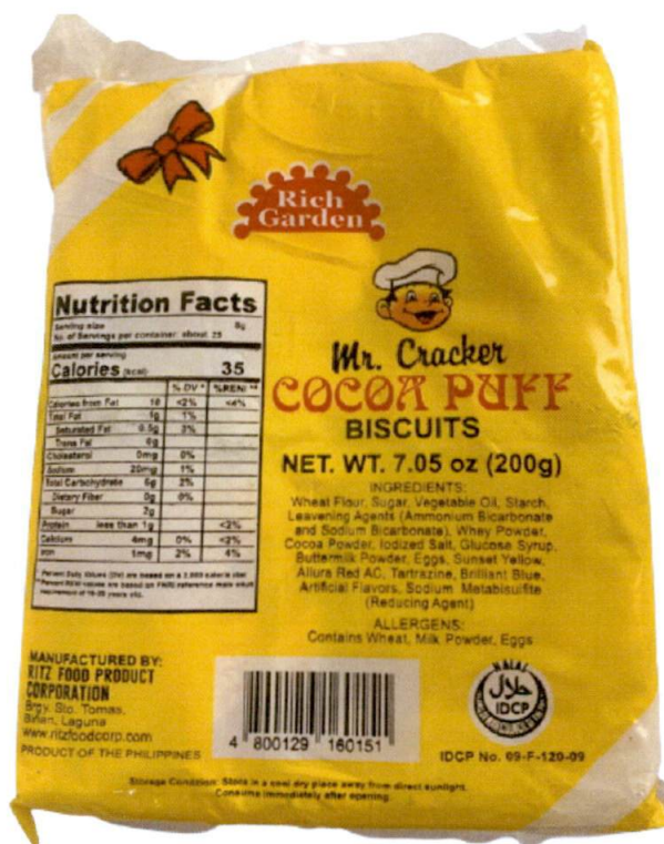
Figure 1. Unregistered RICH GARDEN MR. CRACKER Cocoa Puff Biscuits

The Food and Drug Administration (FDA) warns all healthcare professionals and the general public NOT TO PURCHASE AND CONSUME the unregistered food product: