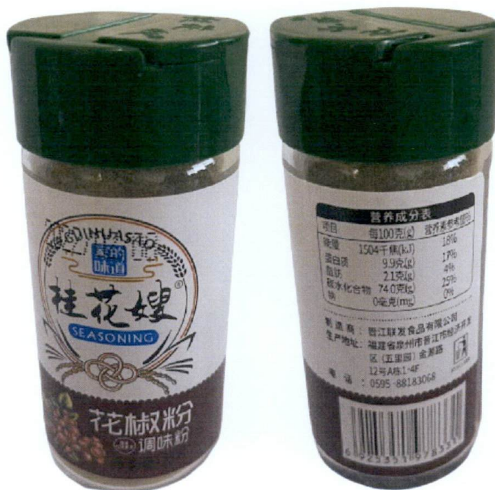
Figure 1. Unregistered GUIHANSAO SEASONING Assumed Seasoning in Plastic Bottle with White and Maroon Label

The Food and Drug Administration (FDA) warns all healthcare professionals and the general public NOT TO PURCHASE AND CONSUME the unregistered food product: