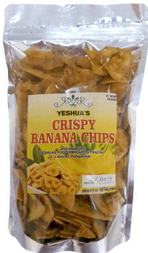
Figure 1. Unregistered YESHUA'S Crispy Banana Chips

The Food and Drug Administration (FDA) warns all healthcare professionals and the general public NOT TO PURCHASE AND CONSUME the unregistered food product: