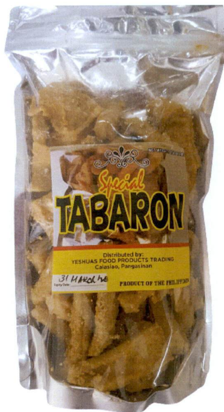
Figure 1. Unregistered UNBRANDED Special Tabaron

The Food and Drug Administration (FDA) warns all healthcare professionals and the general public NOT TO PURCHASE AND CONSUME the unregistered food product: