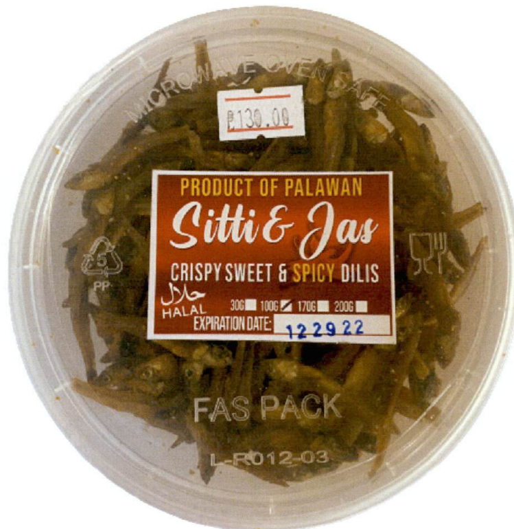
Figure 1. Unregistered SITTI & JAS Crispy Sweet & Spicy Dilis

The Food and Drug Administration (FDA) warns all healthcare professionals and the general public NOT TO PURCHASE AND CONSUME the unregistered food product: