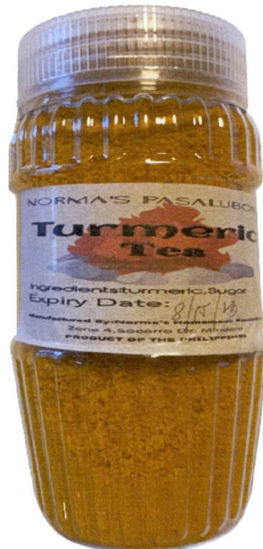
Figure 1. Unregistered NORMA'S PASALUBONG Turmeric Tea

The Food and Drug Administration (FDA) warns all healthcare professionals and the general public NOT TO PURCHASE AND CONSUME the unregistered food product: