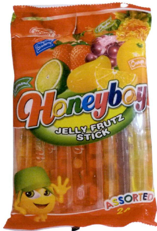
Figure 1. Unregistered HONEY Honeyboy Jelly Fruitz Stick Assorted

The Food and Drug Administration (FDA) warns all healthcare professionals and the general public NOT TO PURCHASE AND CONSUME the unregistered food product: