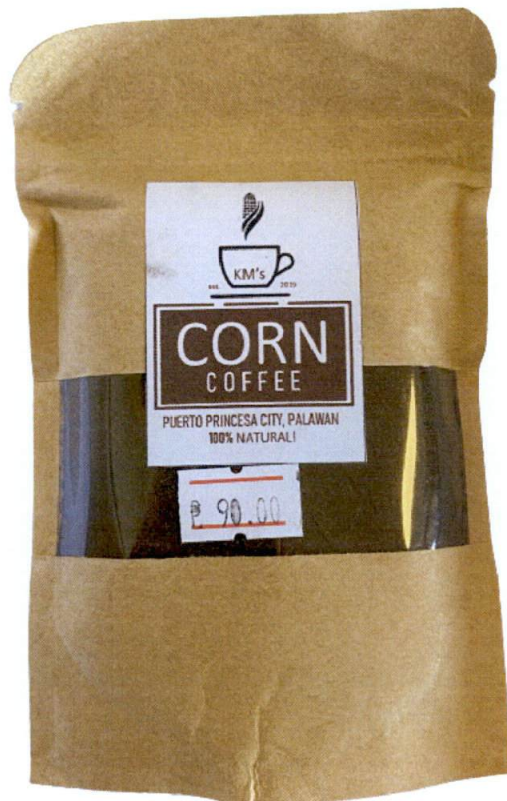
Figure 1. Unregistered KM'S Corn Coffee

The Food and Drug Administration (FDA) warns all healthcare professionals and the general public NOT TO PURCHASE AND CONSUME the unregistered food product: