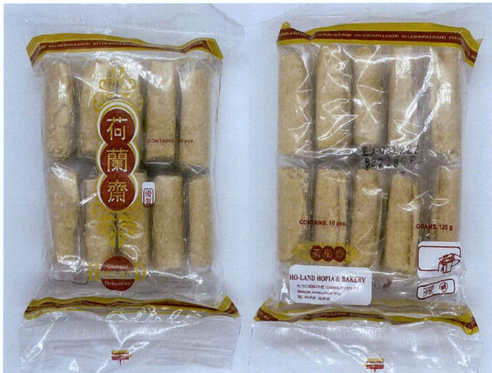
Figure 1. Unregistered HO-LAND CHINESE DELICACIES Assumed Peanut Bars

The Food and Drug Administration (FDA) warns all healthcare professionals and the general public NOT TO PURCHASE AND CONSUME the unregistered food product: