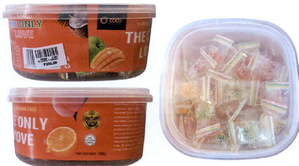
Figure 1. Unregistered COCO FALL IN LOVE WITH Coco Blend Fudge Jar

The Food and Drug Administration (FDA) warns all healthcare professionals and the general public NOT TO PURCHASE AND CONSUME the unregistered food product: