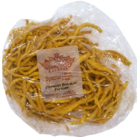
Figure 1. Unregistered LOBO Special Canton

The Food and Drug Administration (FDA) warns all healthcare professionals and the general public NOT TO PURCHASE AND CONSUME the unregistered food product: