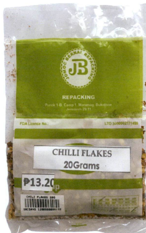
Figure 1. Unregistered JB REPACKING Chilli Flakes

The Food and Drug Administration (FDA) warns all healthcare professionals and the general public NOT TO PURCHASE AND CONSUME the unregistered food product: