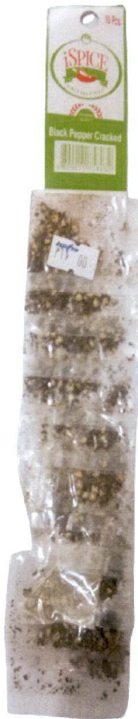
Figure 1. Unregistered ISPICE Black Pepper Cracked

The Food and Drug Administration (FDA) warns all healthcare professionals and the general public NOT TO PURCHASE AND CONSUME the unregistered food product: