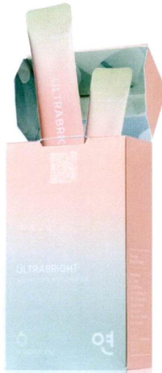
Figure 1. Unregistered THE APRILAB Ultrabright Glutathione Anti-Oxidizer

The Food and Drug Administration (FDA) warns all healthcare professionals and the general public NOT TO PURCHASE AND CONSUME the unregistered food product: