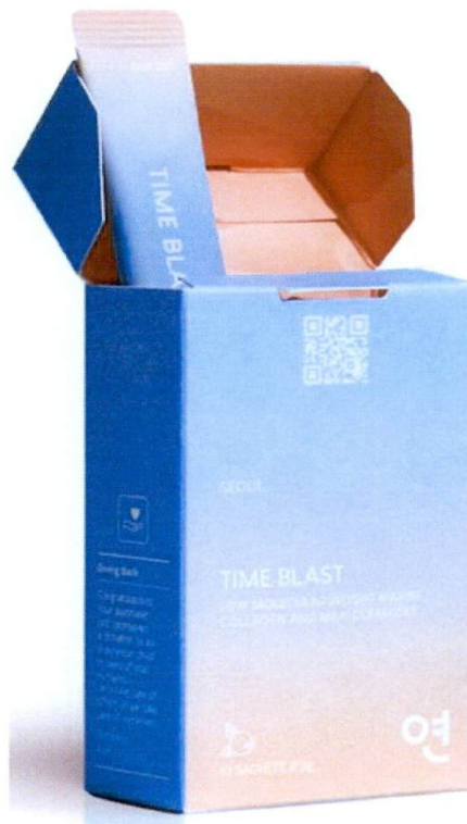
Figure 1. Unregistered THE APRILAB Time Blast Low Molecular Weight Marine Collagen and Milk Ceramides

The Food and Drug Administration (FDA) warns all healthcare professionals and the general public NOT TO PURCHASE AND CONSUME the unregistered food product: