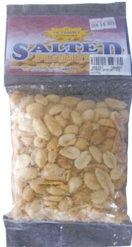
Figure 1. Unregistered YA YAMMY DELICACIES Salted Peanuts

The Food and Drug Administration (FDA) warns all healthcare professionals and the general public NOT TO PURCHASE AND CONSUME the unregistered food product: