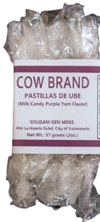
Figure 1. Unregistered COW BRAND Pastillas De Ube Milk Candy Purple Yam Flavour

The Food and Drug Administration (FDA) warns all healthcare professionals and the general public NOT TO PURCHASE AND CONSUME the unregistered food product: