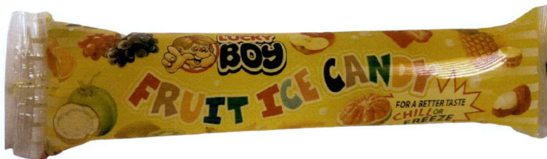
Figure 1. Unregistered LUCKY BOY Fruit Ice Candy

The Food and Drug Administration (FDA) warns all healthcare professionals and the general public NOT TO PURCHASE AND CONSUME the unregistered food product: