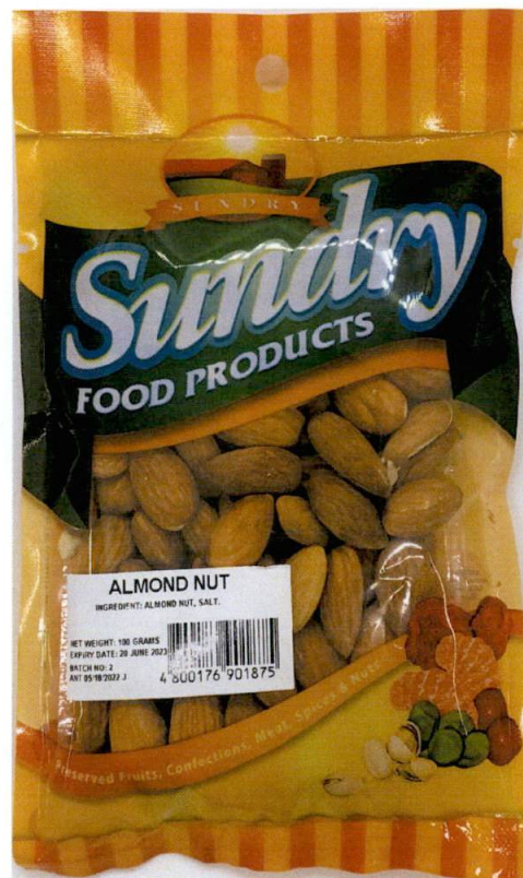
Figure 1. Unregistered SUNDRY FOOD PRODUCTS Almond Nut

The Food and Drug Administration (FDA) warns all healthcare professionals and the general public NOT TO PURCHASE AND CONSUME the unregistered food product: