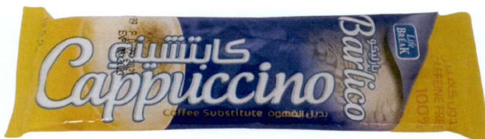
Figure 1. Unregistered LIFE BREAK BARLICO Cappuccino Coffee Substitute

The Food and Drug Administration (FDA) warns all healthcare professionals and the general public NOT TO PURCHASE AND CONSUME the unregistered food product: