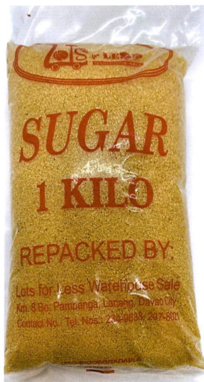
Figure 1. Unregistered LOTS FOR LESS WAREHOUSE SALE Sugar

The Food and Drug Administration (FDA) warns all healthcare professionals and the general public NOT TO PURCHASE AND CONSUME the unregistered food product: