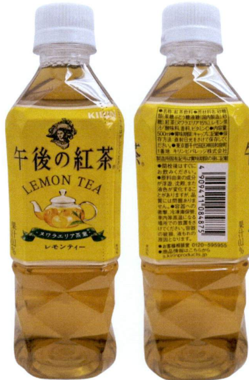
Figure 1. Unregistered KIRIN Lemon Tea (In Foreign Language)

The Food and Drug Administration (FDA) warns all healthcare professionals and the general public NOT TO PURCHASE AND CONSUME the unregistered food product: