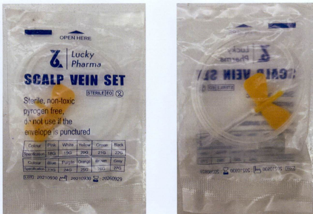
Figure 2. Unregistered Lucky Pharma Scalp Vein Set

The FDA verified through post-marketing surveillance that the above-mentioned medical device products are not registered, and no corresponding Product Registration Certificates have been issued. Pursuant to the Republic Act No. 9711, otherwise known as the “Food and Drug Administration Act of 2009”, the manufacture, importation, exportation, sale, offering for sale, distribution, transfer, non-consumer use, promotion, advertising, or sponsorship of health products without the proper authorization is prohibited.