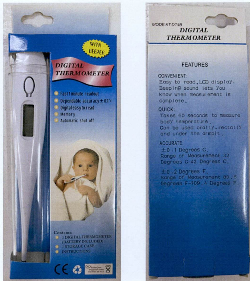
Figure 1. Unregistered Digital Thermometer with Beeper Mode: KT-DT4B

The Food and Drug Administration (FDA) warns all healthcare professionals and the general public NOT TO PURCHASE AND USE the following unregistered medical device products: