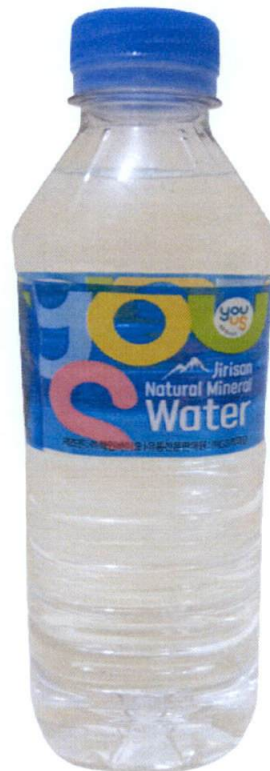
Figure 1. Unregistered YOU US GS RETAIL Jirisan Natural Mineral Water (In Foreign Language)

The Food and Drug Administration (FDA) warns all healthcare professionals and the general public NOT TO PURCHASE AND CONSUME the unregistered food product: