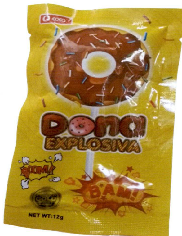
Figure 1. Unregistered COCO Dona Explosiva

The Food and Drug Administration (FDA) warns all healthcare professionals and the general public NOT TO PURCHASE AND CONSUME the unregistered food product: