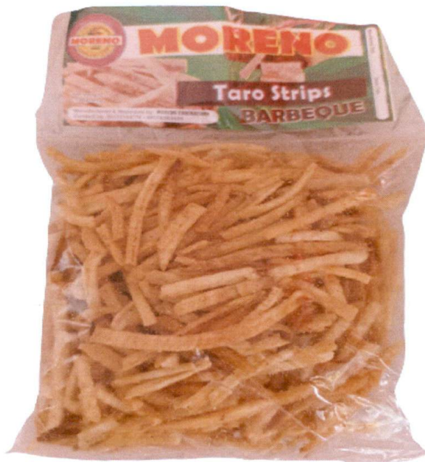
Figure 1. Unregistered MORENO Taro Strips Barbeque

The Food and Drug Administration (FDA) warns all healthcare professionals and the general public NOT TO PURCHASE AND CONSUME the unregistered food product: