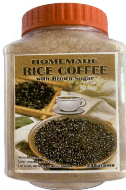
Figure 1. Unregistered UNBRANDED Homemade Rice Coffee with Brown Sugar

The Food and Drug Administration (FDA) warns all healthcare professionals and the general public NOT TO PURCHASE AND CONSUME the unregistered food product: