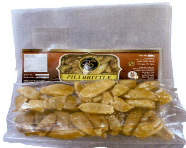
Figure 1. Unregistered EDGELINE PILI PRODUCTS Pili Brittle

The Food and Drug Administration (FDA) warns all healthcare professionals and the general public NOT TO PURCHASE AND CONSUME the unregistered food product: