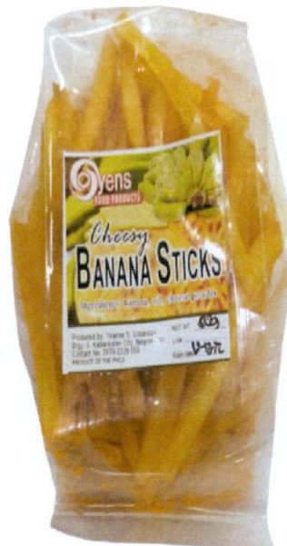
Figure 1. Unregistered YENS FOOD PRODUCTS Cheesy Banana Sticks

The Food and Drug Administration (FDA) warns all healthcare professionals and the general public NOT TO PURCHASE AND CONSUME the unregistered food product: