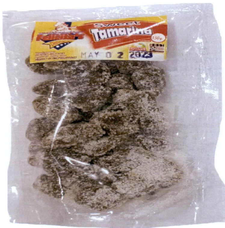
Figure 1. Unregistered FELICITA'S DELICACIES Sweet Tamarind

The Food and Drug Administration (FDA) warns all healthcare professionals and the general public NOT TO PURCHASE AND CONSUME the unregistered food product: