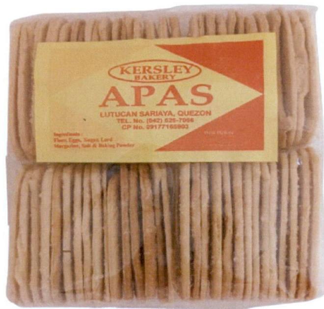
Figure 1. Unregistered KERSLEY BAKERY Apas

The Food and Drug Administration (FDA) warns all healthcare professionals and the general public NOT TO PURCHASE AND CONSUME the unregistered food product: