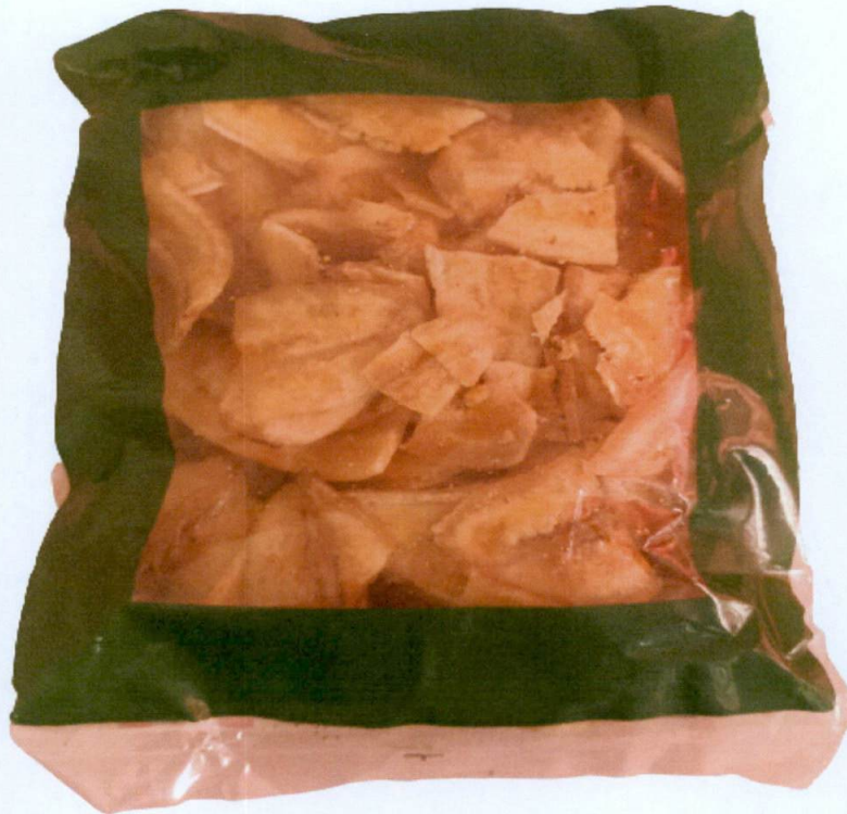
Figure 1. Unregistered PICK & PACK Banana Chips with Honey

The FDA verified through online monitoring or post-marketing surveillance that the abovementioned food product is not registered and no corresponding Certificate of Product Registration (CPR) has been issued. Pursuant to the Republic Act No. 9711, otherwise known as the “Food and Drug Administration Act of 2009”, the manufacture, importation, exportation, sale, offering for sale, distribution, transfer, non-consumer use, promotion, advertising or sponsorship of health products without the proper authorization is prohibited.