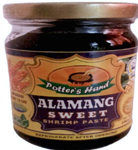
Figure 1. Unregistered POTTER'S HAND Alamang Sweet Shrimp Paste

The Food and Drug Administration (FDA) warns all healthcare professionals and the general public NOT TO PURCHASE AND CONSUME the unregistered food product: