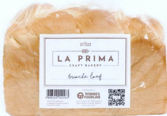
Figure 1. Unregistered LA PRIMA CRAFT BAKERY Brioche Loaf

The FDA verified through online monitoring or post-marketing surveillance that the abovementioned food product is not registered and no corresponding Certificate of Product Registration (CPR) has been issued. Pursuant to the Republic Act No. 9711, otherwise known as the “Food and Drug Administration Act of 2009”, the manufacture, importation, exportation, sale, offering for sale, distribution, transfer, non-consumer use, promotion, advertising or sponsorship of health products without the proper authorization is prohibited.