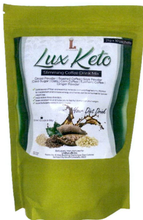
Figure 1. Unregistered LUX KETO Slimming Coffee Drink Mix

The Food and Drug Administration (FDA) warns all healthcare professionals and the general public NOT TO PURCHASE AND CONSUME the unregistered food product: