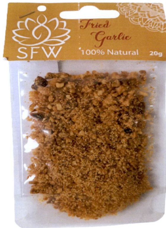
Figure 1. Unregistered SFW Fried Garlic

The Food and Drug Administration (FDA) warns all healthcare professionals and the general public NOT TO PURCHASE AND CONSUME the unregistered food product: