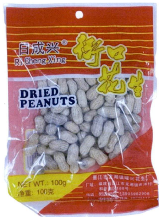
Figure 1. Unregistered RI CHENG XING Dried Peanuts (In Foreign Language)

The Food and Drug Administration (FDA) warns all healthcare professionals and the general public NOT TO PURCHASE AND CONSUME the unregistered food product: