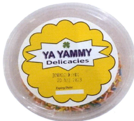
Figure 1. Unregistered YA YAMMY DELICACIES Sprinkles

The Food and Drug Administration (FDA) warns all healthcare professionals and the general public NOT TO PURCHASE AND CONSUME the unregistered food product: