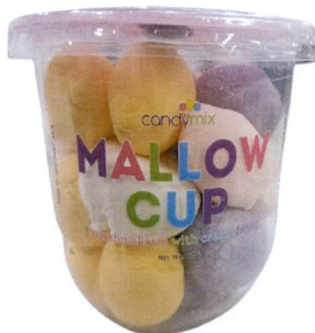
Figure 1. Unregistered CANDYMIX Mallow Cup - Marshmallow with Cream Filling

The Food and Drug Administration (FDA) warns all healthcare professionals and the general public NOT TO PURCHASE AND CONSUME the unregistered food product: