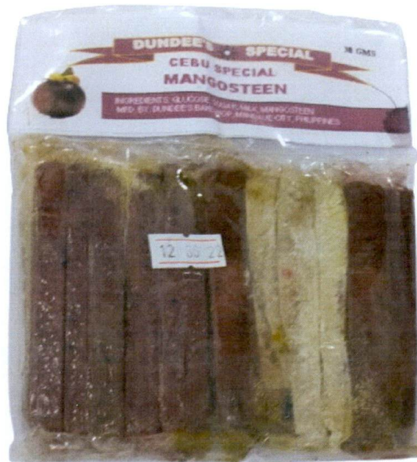
Figure 1. Unregistered DUNDEE'S SPECIAL Cebu Special Mangosteen Stick

The Food and Drug Administration (FDA) warns all healthcare professionals and the general public NOT TO PURCHASE AND CONSUME the unregistered food product: