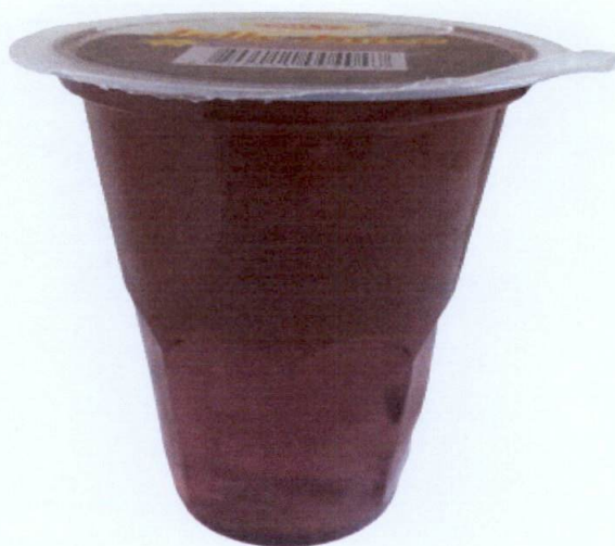
Figure 1. Unregistered JOLY Jelly Juice (Color Violate)

The FDA verified through online monitoring or post-marketing surveillance that the abovementioned food product is not registered and no corresponding Certificate of Product Registration (CPR) has been issued. Pursuant to the Republic Act No. 9711, otherwise known as the “Food and Drug Administration Act of 2009”, the manufacture, importation, exportation, sale, offering for sale, distribution, transfer, non-consumer use, promotion, advertising or sponsorship of health products without the proper authorization is prohibited.