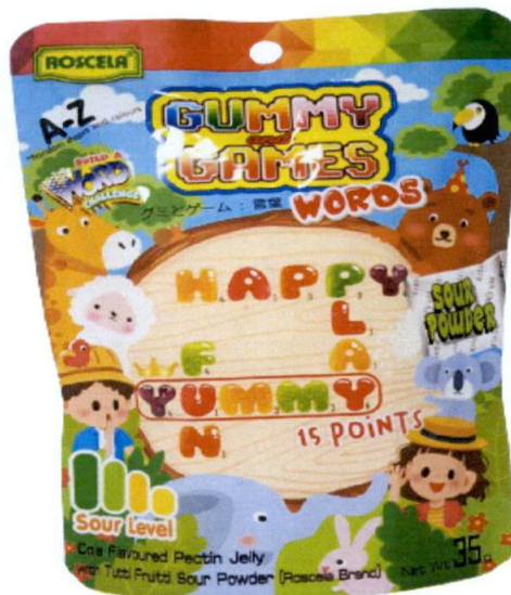
Figure 1. Unregistered ROSCELA BRAND Gummy and Games Words (Cola Flavoured Pectin Jelly with Tutti Fruitti Sour Powder)

The Food and Drug Administration (FDA) warns all healthcare professionals and the general public NOT TO PURCHASE AND CONSUME the unregistered food product: